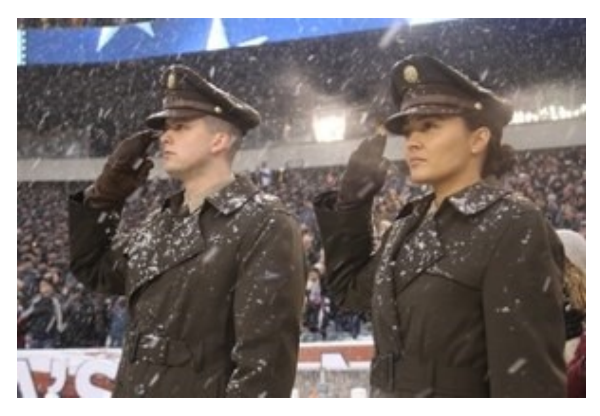
It's official: Army approves 'pinks and greens' uniform on Veterans Day